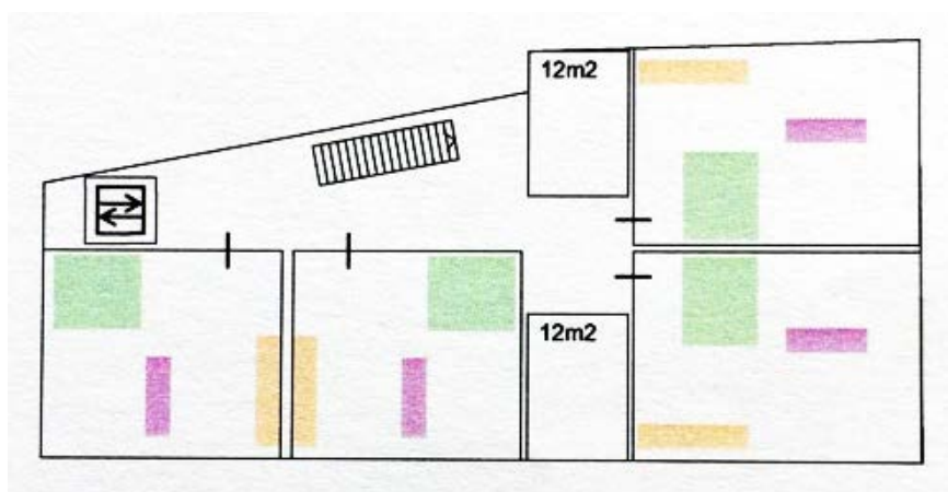
III. 2 Module – plot example

The houses will be produced with modular systems, so it is possible to build more than one floor. Finomics develops the modules with their networking partners which have broad experiences in this area. With modular construction kits the costs can be reduced and provide architectural diversity with ecological material and individual designs. The constructions will be adapted to the landscape and surroundings. A greater contract volume provides economies of scale.